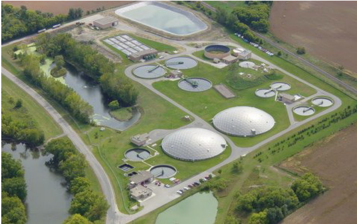
An aerial image of the current Water Reclamation Facility in Mason City, Iowa.