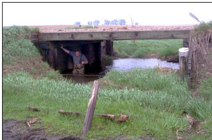
Kevin Boehmer, a WHKS NBIS-Certified Inspector, performs a bridge inspection.

The goal of the bridge inspection program is to insure the safety of the traveling public by inspecting, evaluating, and properly documenting the results for every bridge. For more information on county and city bridge inspection, please contact a WHKS office.