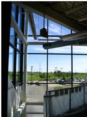
Glass stairwell at the Sauer-Danfoss facility.

The first project consists of a $6.1 million, 36,000-s.f. addition to the Sauer-Danfoss manufacturing facility. The two-story office expansion is framed with structural steel and precast concrete exterior walls. The new building features large open office space, a cafeteria and kitchen, and two unique glass-enclosed stairwells. It was also designed to accommodate possible further expansion in the future. Some challenging aspects of the project design