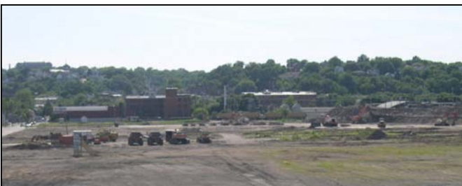
The first phase of the site work is underway.

The project requires extensive coordination with the developers, the City of Dubuque and the utility companies. This initial phase of the project is expected to be complete late Fall of 2008.