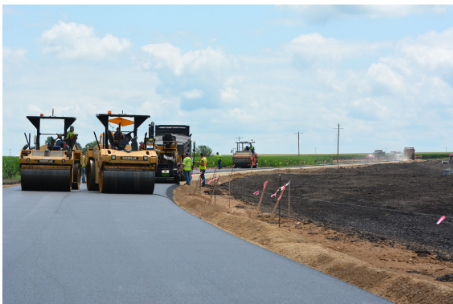
Construction of CH 30

The alignments of Macon County Highway 30 and State Route 48 have always been problematic. So way back in 2005, the County set out to improve things. The in-house engineering staff surveyed, developed a new alignment, obtained environmental permitting and began the preliminary engineering. But the unfinished project was put on hold when the lead engineer left to work for a different jurisdiction.